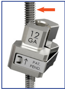
1. Snap on Rod