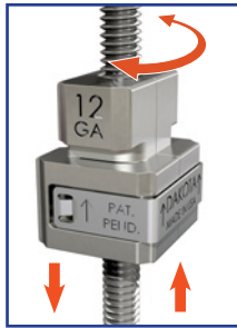
2. Adjust Up/Down